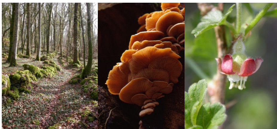
French Medieval vineyards recolonized by forest © J.L. Dupouey; Fungus on log © M. Pitsch Ribes uva-crispa , an indicator species often found on abandoned human settlements in forests © J.L. Dupouey