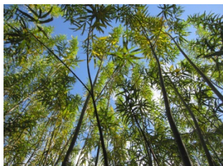
Three-year old willow ( Salix schwerinii x S. viminalis) plantation for biomass production in French Ardennes